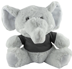
ELEPHANT PLUSH * POSITIONAL REFERENCE ONLY

Screen Print: 60mmW x 30mmH Digital Transfer: 60mmW x 30mmH